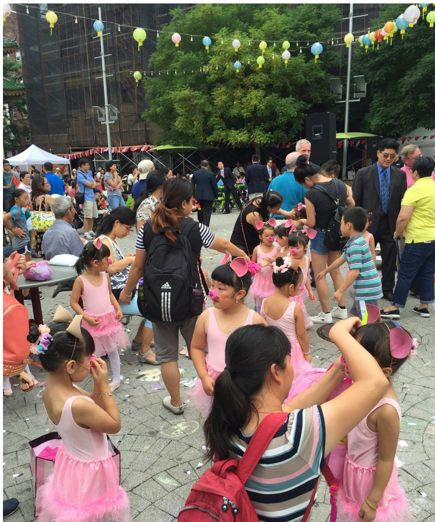
Chinatown Main Street Lantern Festival in 2017