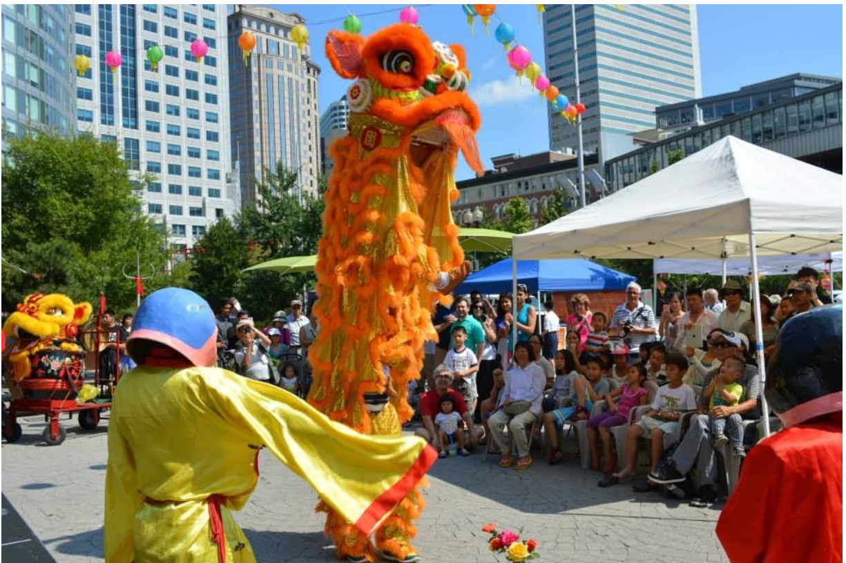
Performances at the Chinatown Main Street Lantern Festival