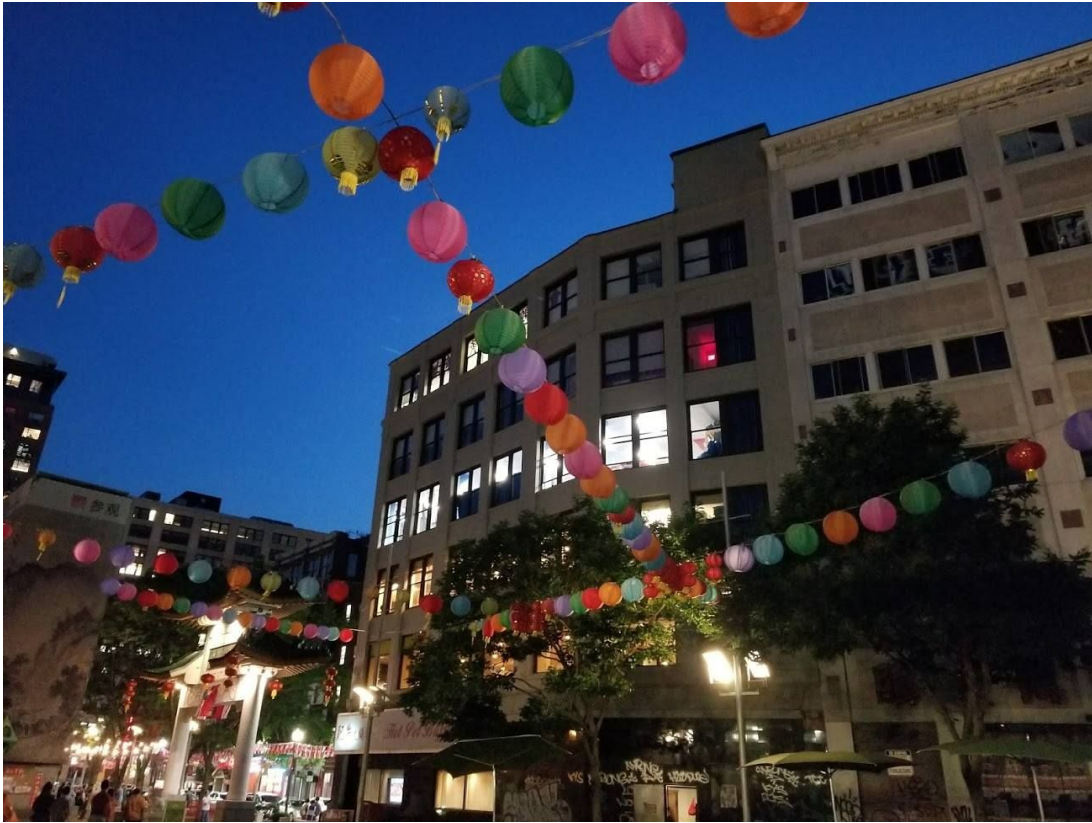
Lanterns installed by Chinatown Main Street in 2017