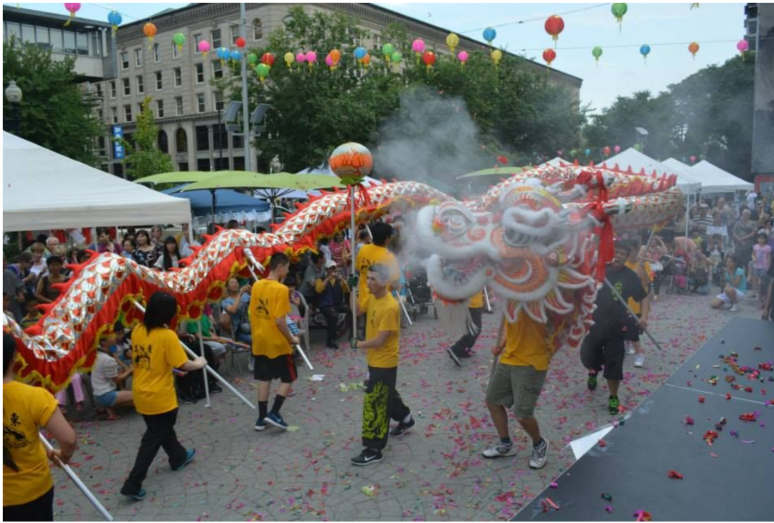
The installation of lanterns in Chinatown Park in 2018