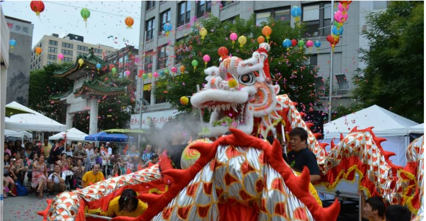
The Main Street Lantern Festival in 2017