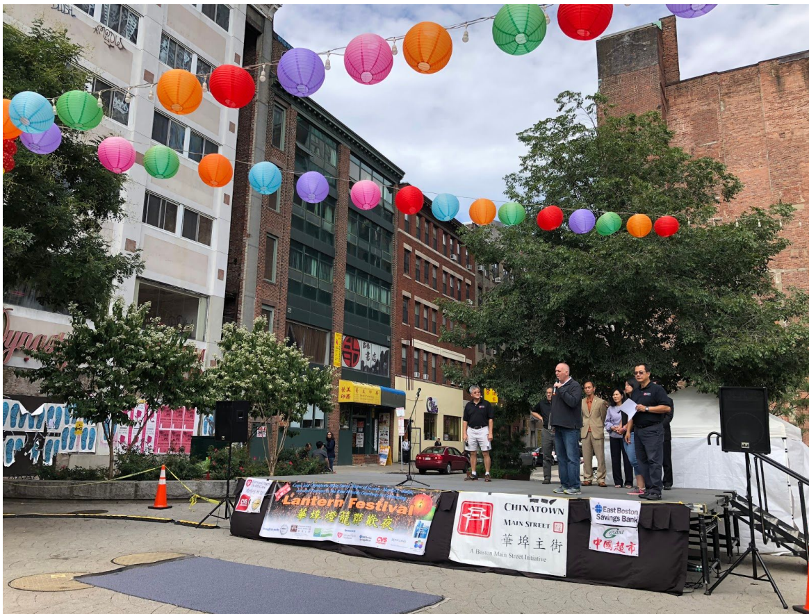
Performances at the Chinatown Main Street Lantern Festival