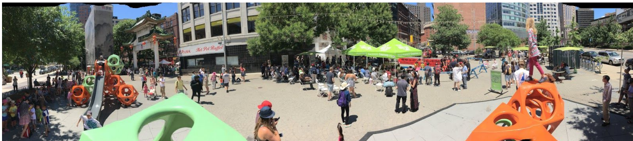
The plaza's existing infrastructure includes trees, Play Cubes playground equipment, and other park amenities.