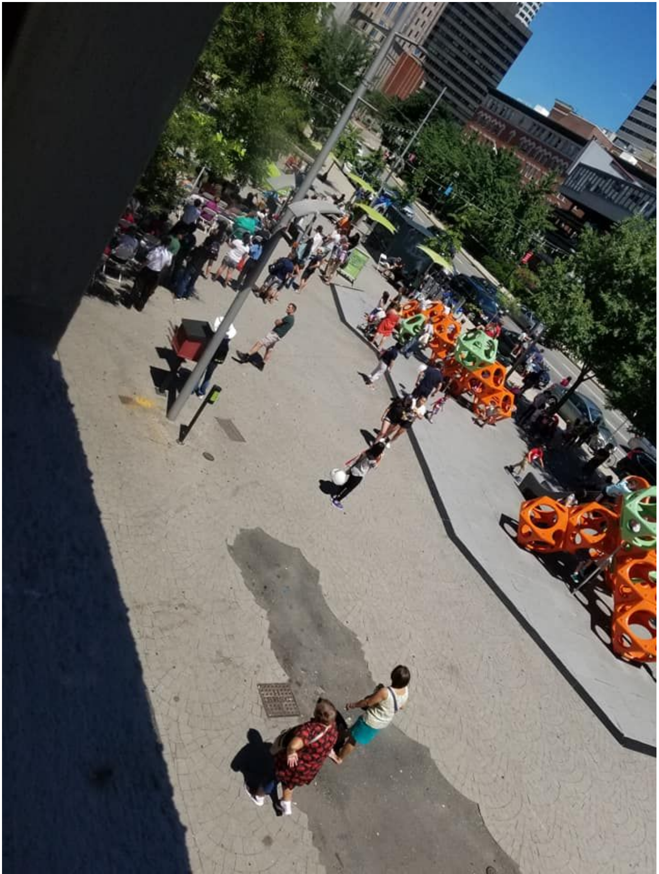
The plaza, shot from above